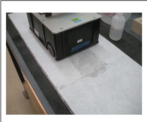
Photo No. 4 DCOF Test in Progress