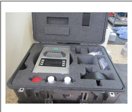
Photo No. 1 BOT 3000E Test Apparatus