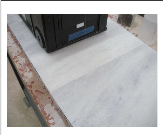
Photo No. 4 DCOF Test in Progress